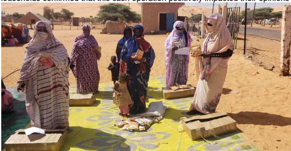
Figure 4: Distribution of enriched flour