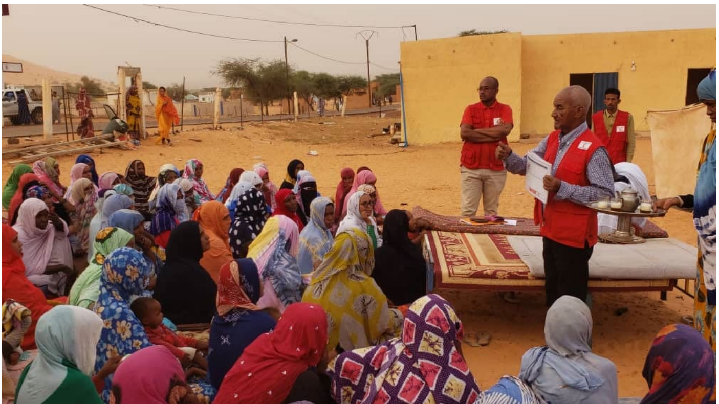
Figure 1: Sensitization sessions on good nutritional practices in Moudjéria, Tagant Region.

The major donors and partners of the Disaster Response Emergency Fund (DREF) include the Red Cross Societies and governments of Belgium, Britain, Canada, Denmark, Germany, Ireland, Italy, Japan, Luxembourg, New Zealand, Norway, Republic of Korea, Spain, Sweden and Switzerland, as well as DG ECHO and Blizzard Entertainment, Mondelez International Foundation, Fortive Corporation and other corporate and private donors. The Canadian Government contributed to replenishing the DREF for this operation. On behalf of Mauritania Red Crescent Society (MRCS), the IFRC would like to extend gratitude to all for their generous contributions.