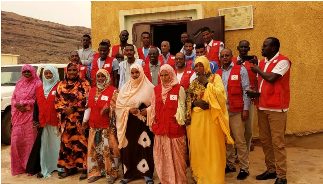
Figure 5: Training of MRC volunteers

This operation has created a network of volunteers in a hard-to-reach area of Mauritania which has very little presence of other humanitarian organizations. However, the network of volunteers needs to be trained further, especially at the NDRT level in the various disaster management themes.